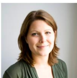
Eva Primavesi Public Relations

I am happy to assist you! For further inquiries please contact me: